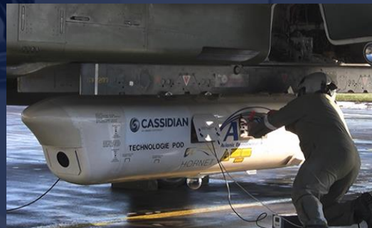
Demonstration of capabilities under extreme conditions (fighter aircraft)