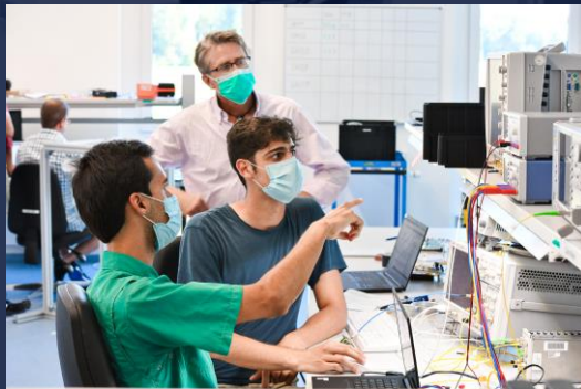
RF Electrical Testing