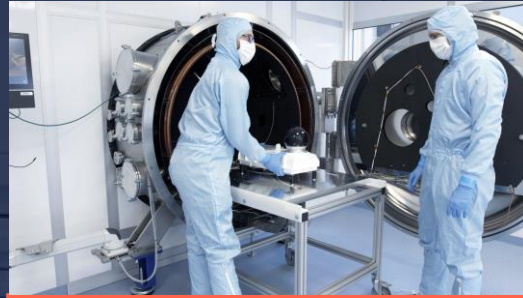
Thermal Vacuum Chamber